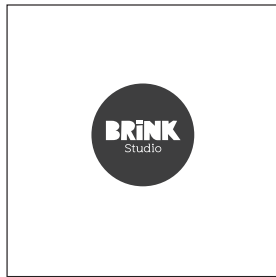
2. Blank card & Brink sticker