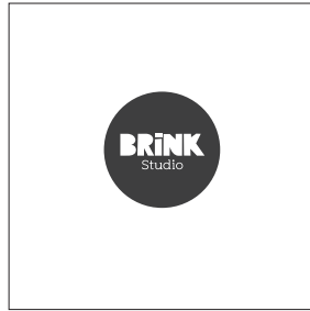
B. Blank card & Brink sticker